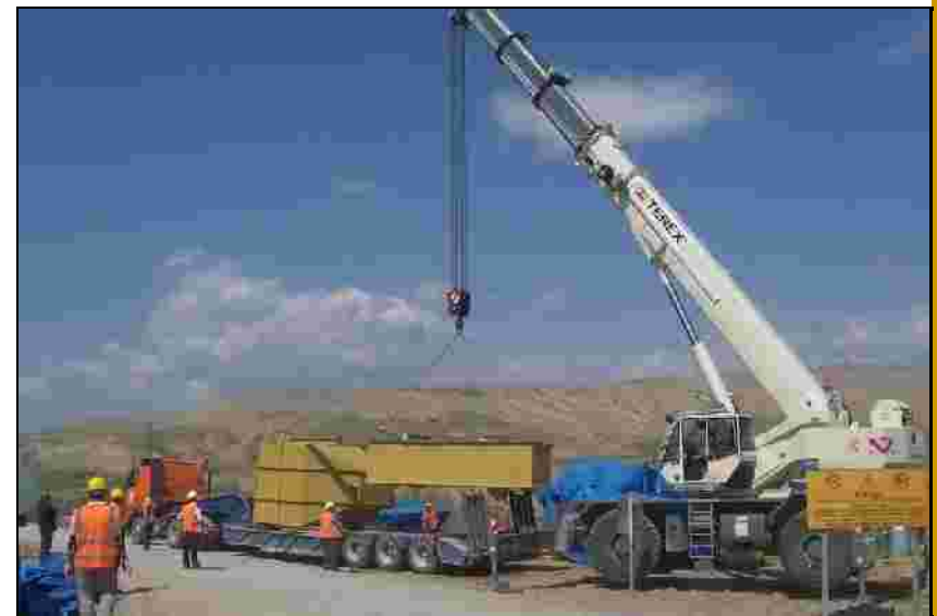
Moving material from train station to mine site

1. C1 cash costs are calculated as direct cash costs net of by-product credits