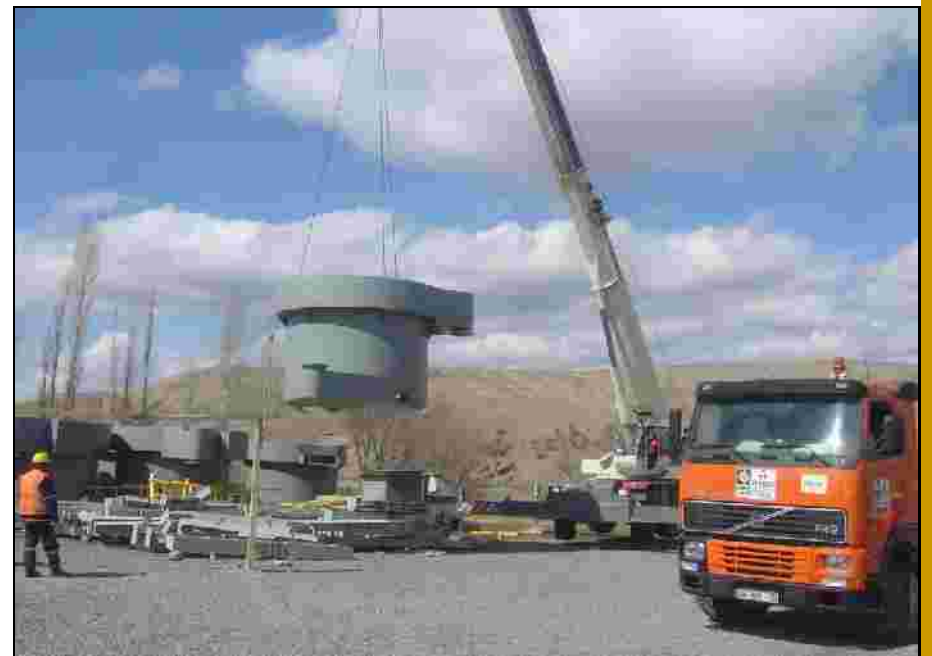
CIC tanks relocating to new laydown area at mine site