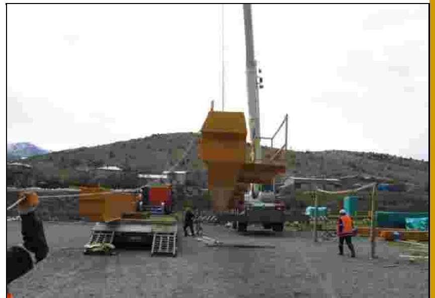
Offloading of bridge crane