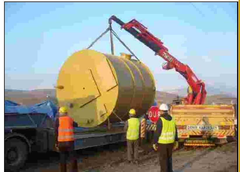
ADR Storage tank