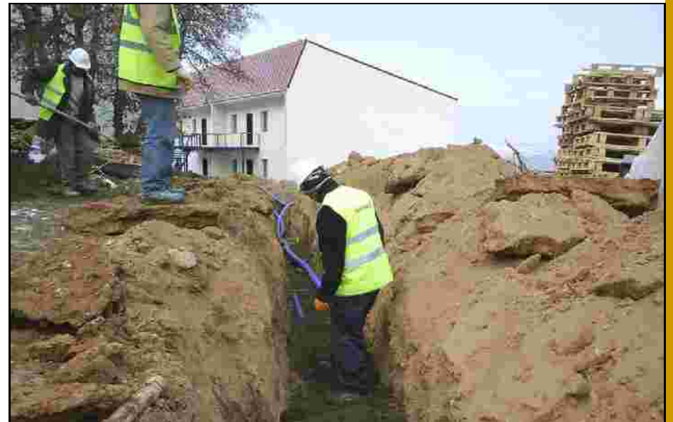
Installing the water line