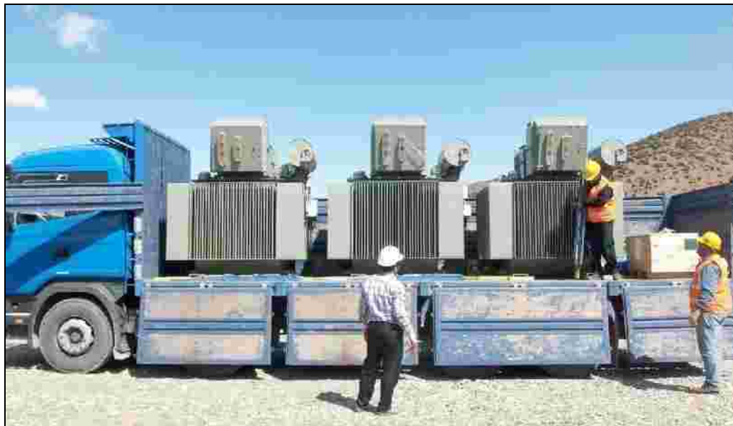
Transformers on site